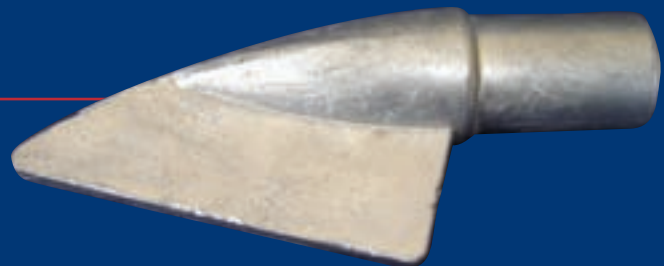
Code: UCI918 BOW RAIL END CAP For rail around boat windscreens