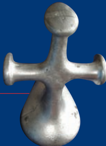
Code: UCI924 BOLLARD Used on boats