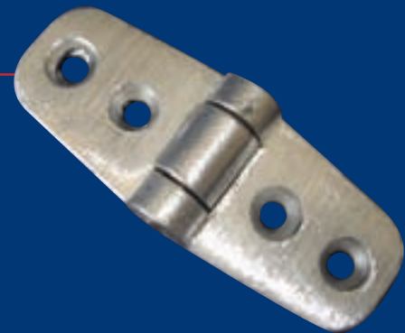
Code: UC1913 FLAT HINGE Cast Aluminium Hinge