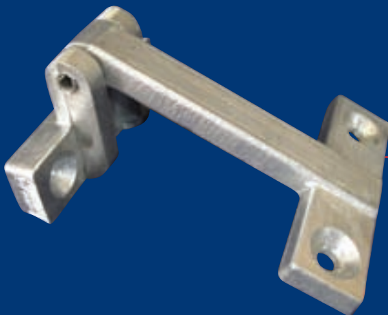
Code: UC1915 CANOPY HINGE Cast Aluminium Hinge