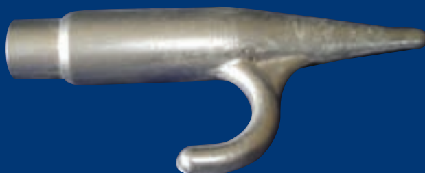
Code: UCI934 BOAT HOOK For retrieving ropes on boats