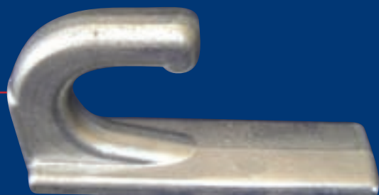
Code: UC1916 ROPE HOOK Used on boats & trailers (not certified)