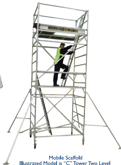
Mobile Scaffold Illustrated Model is "C" Tower Two Level