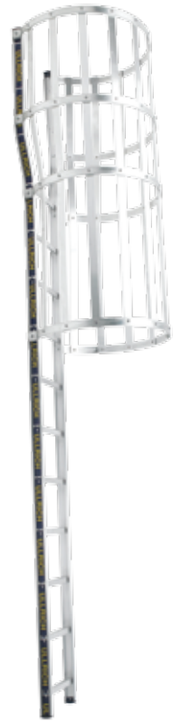
Silo or Fire Escape Ladders