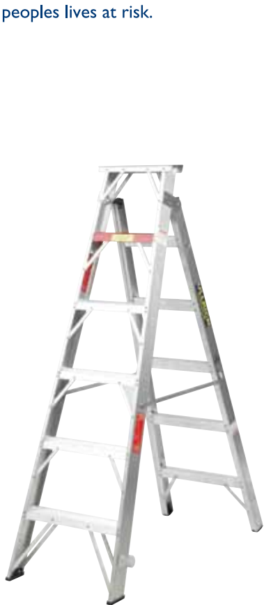
CS Model Combination Step Ladder

This is an example of how the quality of consumer products has deteriorated in recent years to the point of putting peoples lives at risk.