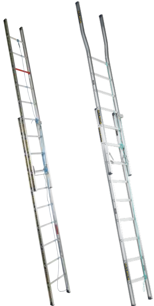
DE SI Model