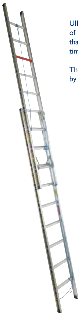
DE S3 Model

Ullrich Aluminium is very concerned that this invasion of unsafe products is continuing unabated and believes that the importation should cease at the earliest possible time.