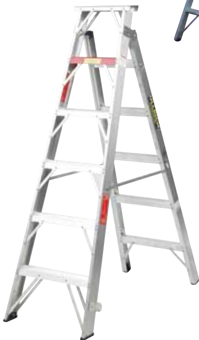
Combination Step Ladder