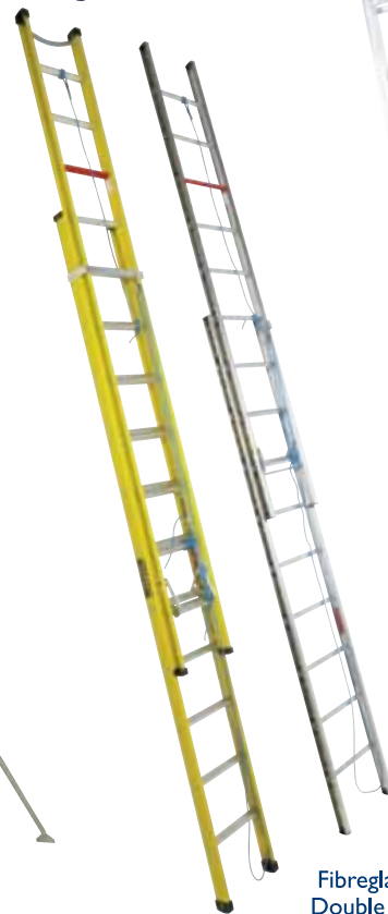
Fiberglass and Aluminium Double Extension Ladders