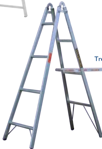
Trestles and Planks