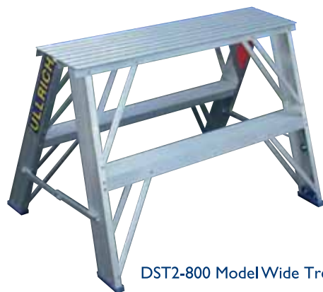
DST2-800 Model Wide Trestle

For additional information on any Ullrich product, either contact your Ullrich Sales Consultant, refer to the back of this brochure for your nearest Ullrich Aluminium Sales Centre, or telephone 0800 500 338 for assistance.