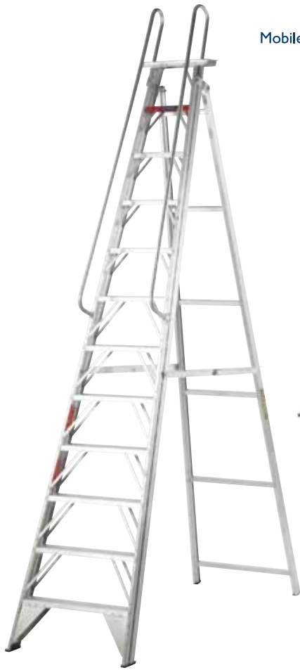
Heavy-Duty Step Ladder