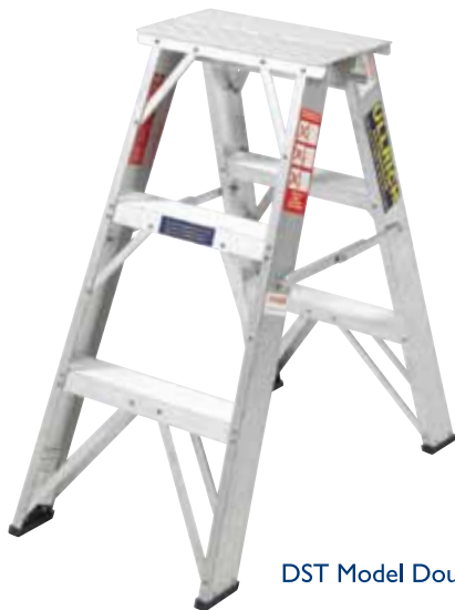
DST Model Double-Sided Step Ladder